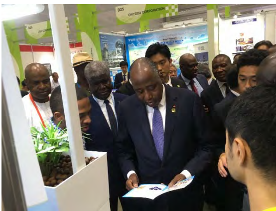
H.E. Mr. Amadou Gon Coulibaly, Prime Minister of the Republic of Côte d'Ivoire (center) and H.E. Mr. Robert Beugré Mambé, Governor (to his left), communicating with a company in Yokohama