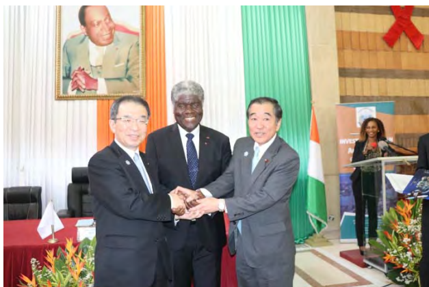
Official Welcome Ceremony by the Abidjan Autonomous District, and meeting with the governor

No. of participants: 16 people from the Japan-Africa Friendship Yokohama City Council Members' League