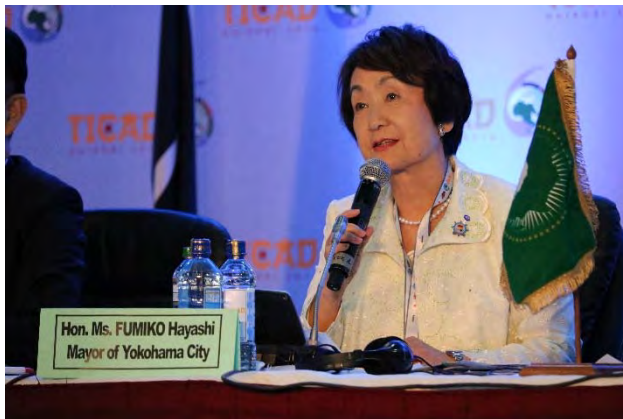
“Improving Socio-Economic Development for Women” side event

The mayor of Yokohama participated in a panel discussion and side event hosted by the Ministry of Land, Infrastructure, Transport and Tourism. During the panel discussion, the mayor introduced Yokohama’s experiences in solving urban issues and announced its active cooperation for urban development in Africa.