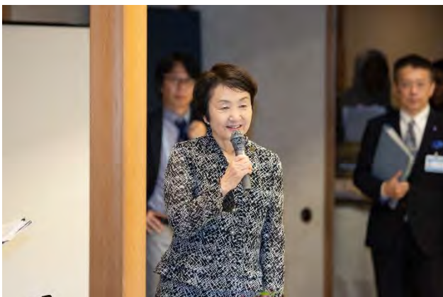
Greeting by Ms. Hayashi Fumiko, Mayor of the City of Yokohama at the luncheon Tea ceremony demonstration