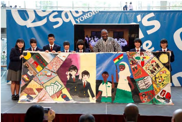
Presentation by Honjuku Junior High School