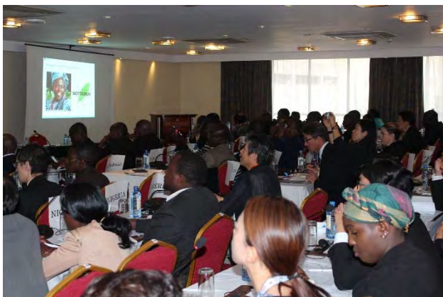
Waste management seminar