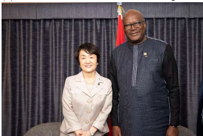
H.E. Mr. Roch Marc Christian Kaboré, President of Burkina Faso

(3) Venue: Yokohama International Organizations Center