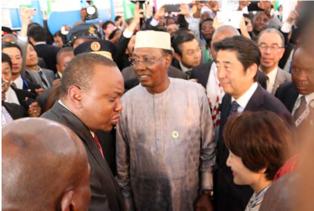
Prime Minister Abe Shinzo visiting the Yokohama booth