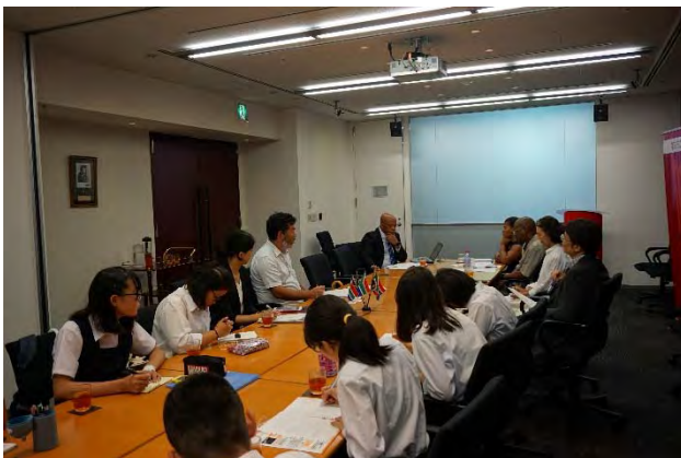
Visit to the embassy