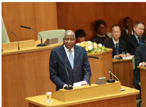
Speech by H.E. Mr. Amadou Gon Coulibaly, Prime Minister of the Republic of Côte d'Ivoire in the assembly hall