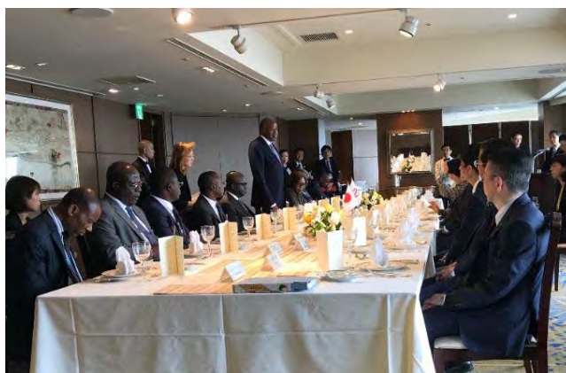
Luncheon hosted by the Yokohama City Council president