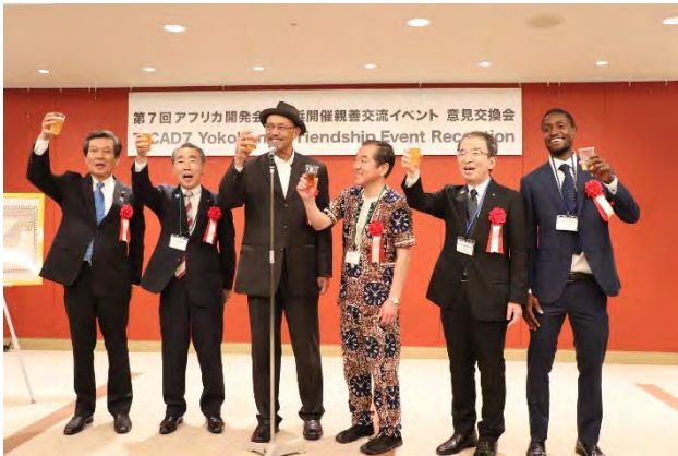
Opening ceremony of the opinion exchange session