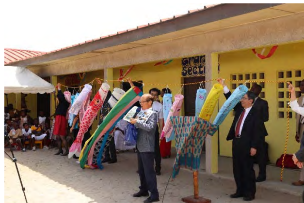
Visit to Atlantide Public Primary School