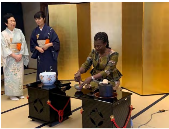
Teicha (serving of powdered green tea, matcha , and a Japanese-style confection)