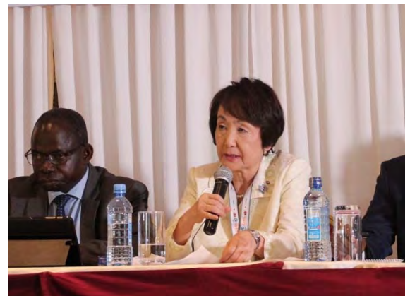
Africa-Japan Public-Private Conference for High-Quality Infrastructure