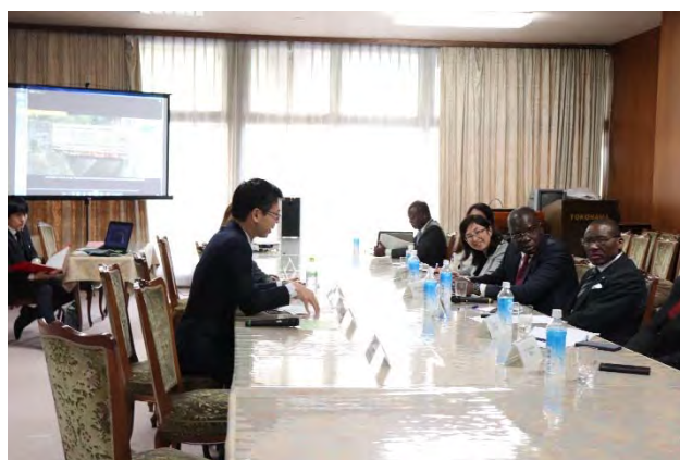
Road measures being explained to the Minister of Economic Infrastructure