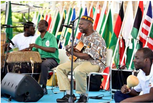
Music performance on the stage