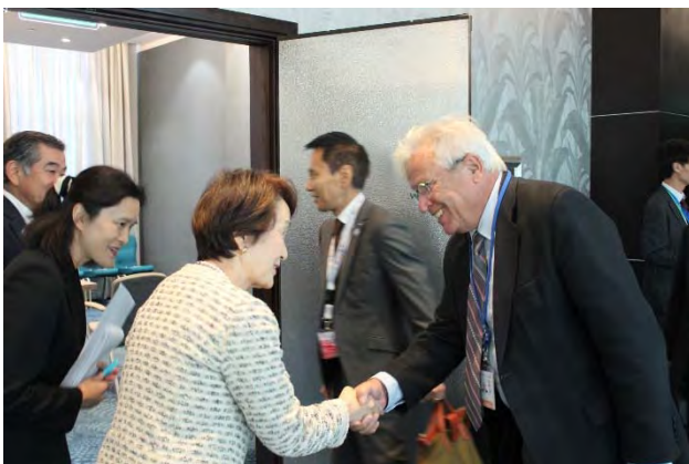
Meeting with Dr. Joan Clos, Executive Director of UN-Habitat