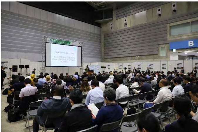
The venue (PACIFICO Yokohama)