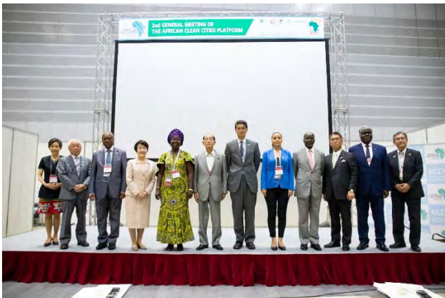
Speakers at the high-level session on August 27, 2019