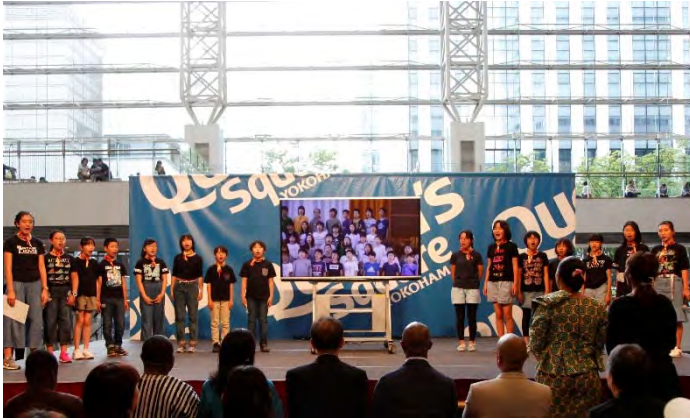
Presentation by Kasama Elementary School