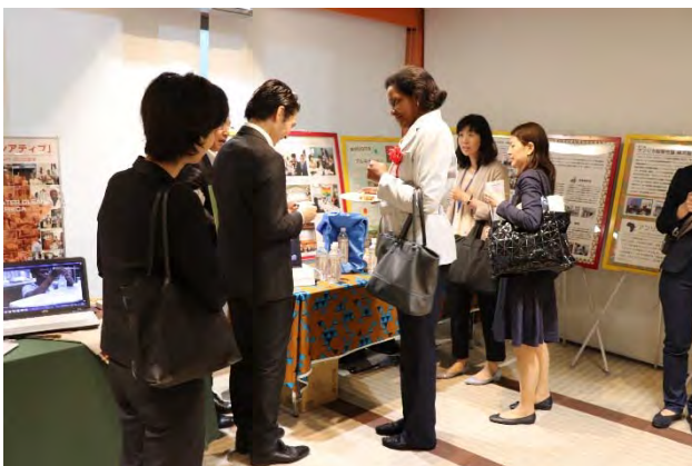
Opinion exchange session