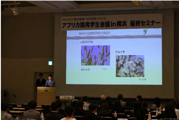
Presentation at the final seminar