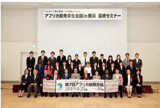
Photograph taken after the final seminar