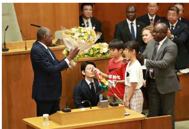
Bouquet presentation to His Excellency by students from Sakuraoka Elementary School