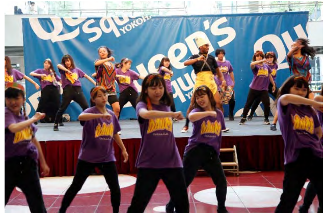
Dance performance by the dance club of Totsuka High School and the African group