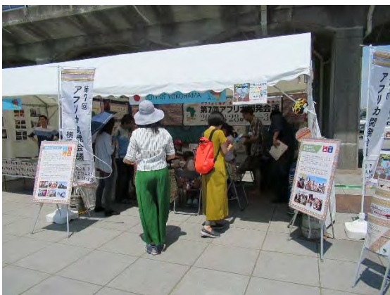
Booth introducing African culture