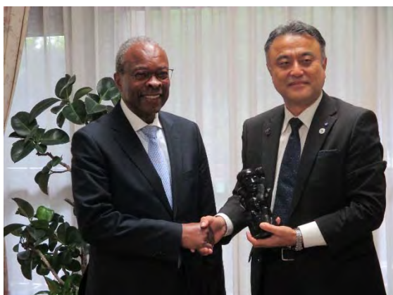
The Hon. Dr. Eneas da Conceição Comiche, Mayor of Maputo