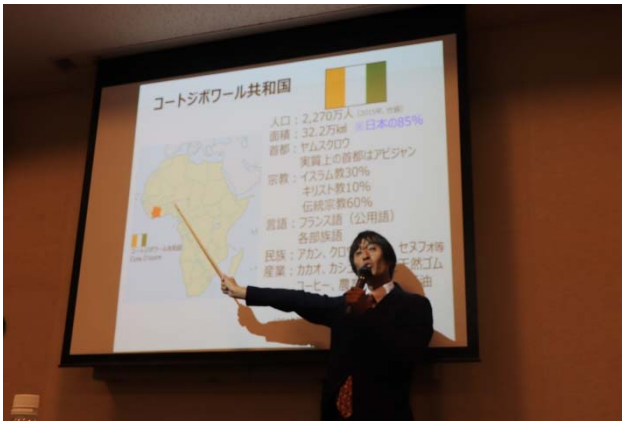
Côte d'Ivoire business workshop