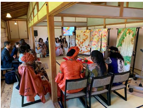
Japanese cultural experience (lecture on kimono)