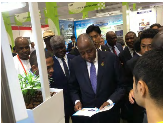
H.E. Mr. Amadou Gon Coulibaly, Prime Minister of the Republic of Côte d'Ivoire, visited the Yokohama booth.