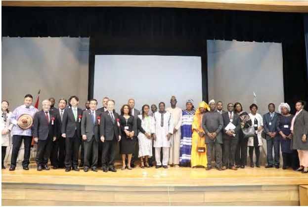
Photograph taken on the day of the event