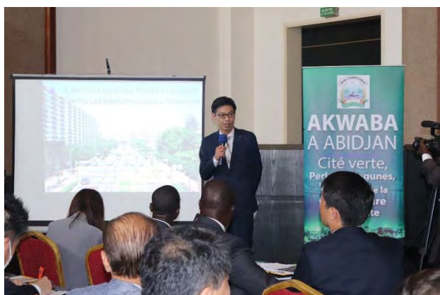
The knowledge-sharing seminar for overcoming urban issues held in the Abidjan Autonomous District