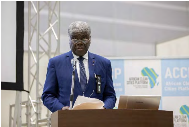
African Clean Cities Platform (ACCP)