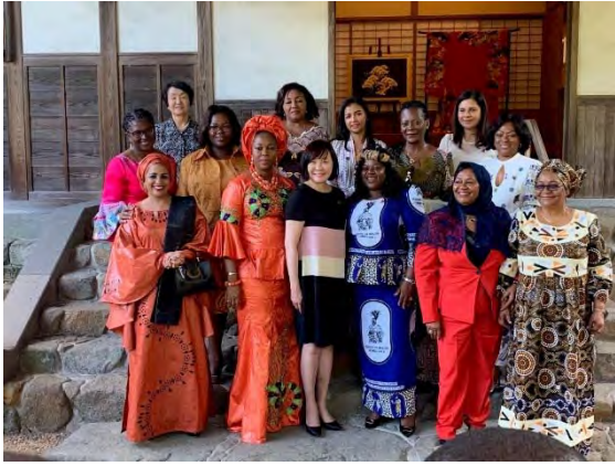
Photograph taken in front of the Kakushokaku