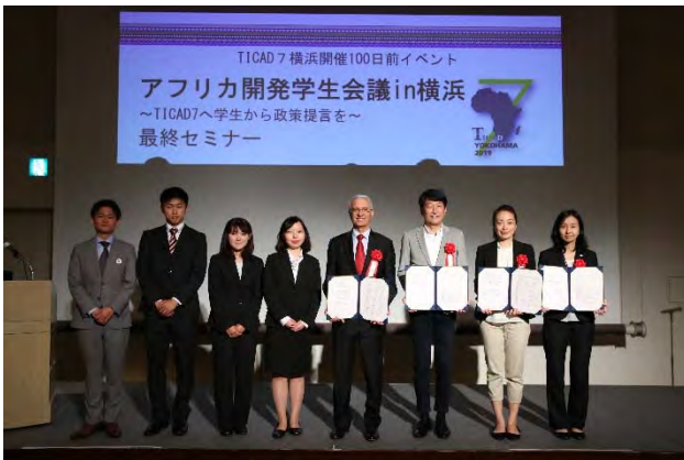
Policy proposal at the final seminar