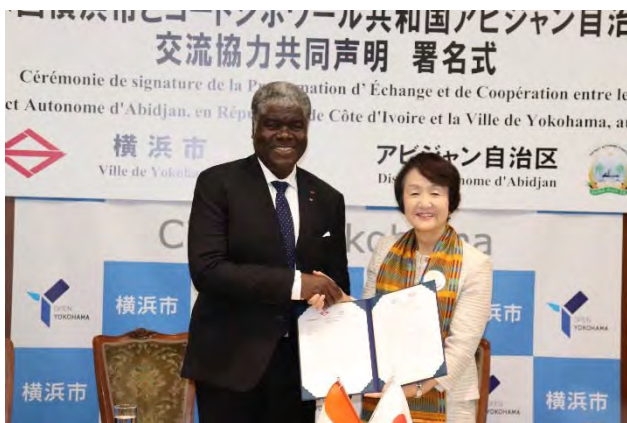
Announcement of the Joint Statement

Through the training program offered by the City of Yokohama and JICA, the Japan-Africa Business Women Exchange Program, businesswomen (entrepreneurs) and related government staff from seven African countries, including the Republic of Côte d'Ivoire, visited Yokohama. They exchanged opinions with the Yokohama municipal staff in charge of support for women's empowerment.