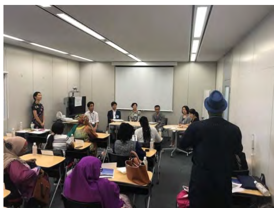
Japan-Africa Business Women Exchange Program