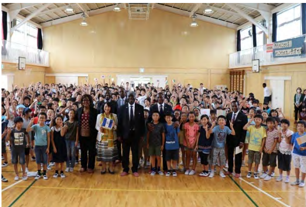
Exchange with Yokohama Municipal Sakuraoka Elementary School

The delegates from the District deepened exchange in the areas designated in the Joint Statement by exchanging opinions with companies in Yokohama, visiting the Minato Mirai District, and participating in a symposium titled "Unleashing the Power of Women and Girls in Africa."