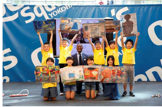
Presentation by Chigasaki Elementary School