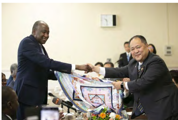
Welcome meeting with the Council President

(Yokohama Bay Hotel, Tokyu Pacific Room)