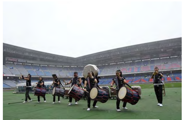
Japanese drum performance