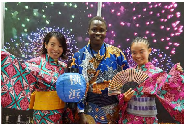
Booth visitors trying on Japanese yukata made of African cloth