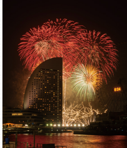
Yokohama Sparkling Twilight

Spring: Ooka River Summer: Marine Park Autumn: Sankeien Garden Winter: Illumination in Minatomirai