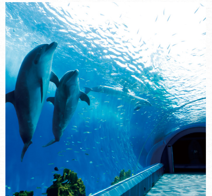
Yokohama Hakkeijima Sea Paradise