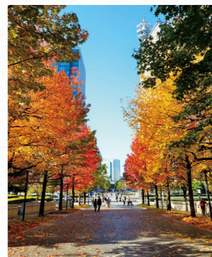
Outside Yokohama Museum of Art