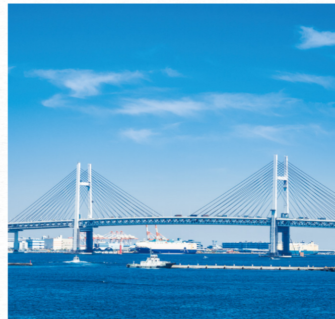
Yokohama Bay Bridge