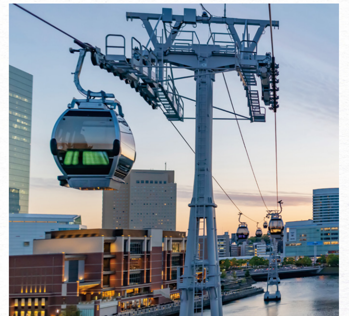
Yokohama Air Cabin