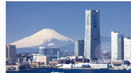
Minatomirai & Mt. Fuji