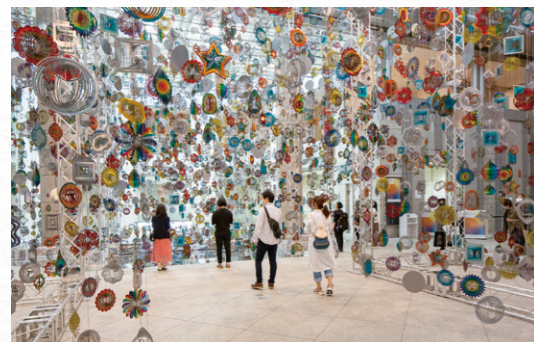
Nick CAVE Kinetic Spinner Forest, 2016( recreated in 2020) ©Nick Cave Installation view of Yokohama Triennale 2020

One of Japan's largest light shows leverages Yokohama's signature bayside scenery to offer a dynamic interplay of illumination and music.