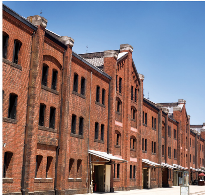
Red Brick Warehouse