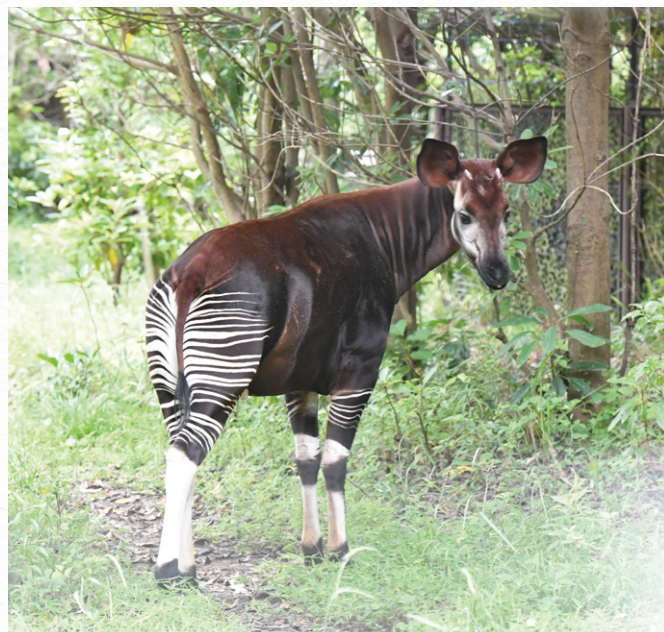
Yokohama Zoological Gardens "ZOORASIA"