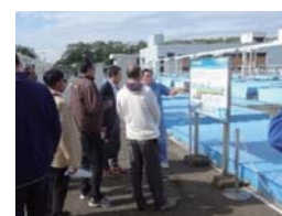
Site visit to a wastewater treatment plant