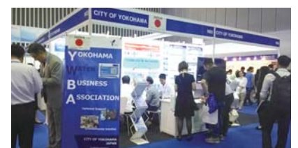
Our booth in Viet Water 2019