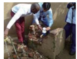
Activities in Malawi