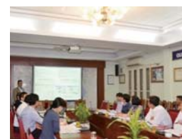
Member companies' presentations on their technologies