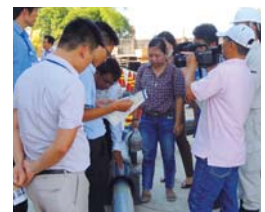
Demonstration of technologies