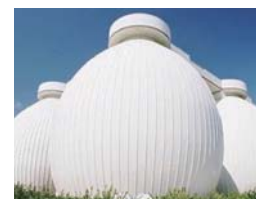
Egg-shaped digestion tank