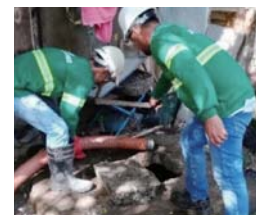
Sludge collection in Cebu