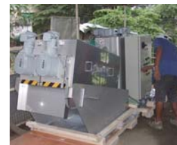
Sludge dewatering equipment installed