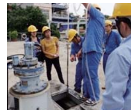
Technical cooperation in Hanoi