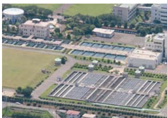
Nishiya Purification Plant