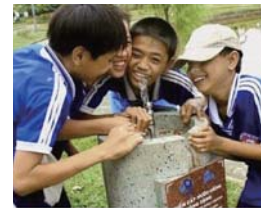
Children drinking water directly from a tap

•Business seminar (6 companies) •Business matching (6 companies)