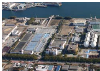
Hokubu Sewerage Center

Amount of annual supply : 414,982,500m 3 Service rate: 100% Non-revenue water rate: 7.2% Purification plants: 3 plants