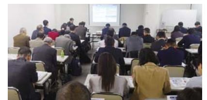
Overseas water business seminar