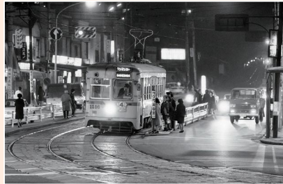
Motomachi on February 21, 1970.